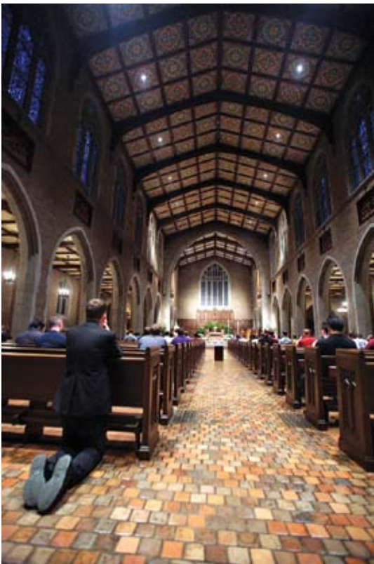
The main chapel features stunning made-in-Detroit Pewabic tiling. The entire chapel underwent extensive cleaning and restoration work in 2009 after a ceiling fire.