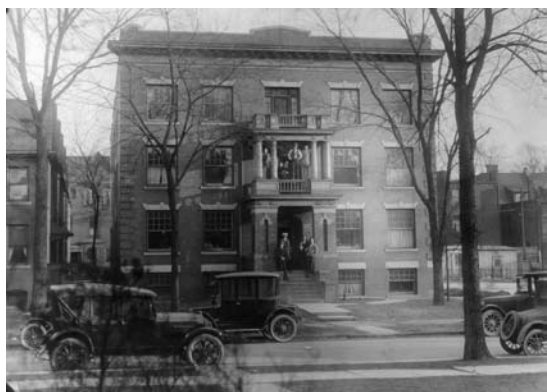
A converted apartment house served as a crowded Holy Angels dormitory on Alexandrine Avenue in midtown Detroit, early 1920s.