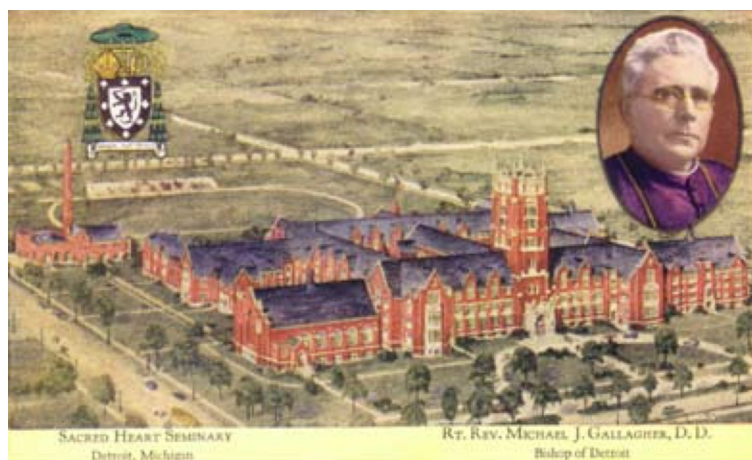
This postcard supported Bishop Gallagher's campaign to raise funds for a new seminary. It features an architectural drawing depicting the future Gothic Revival seminary complex.

In 1958, the high school was separated from the college seminary. To accommodate this change, the Cardinal Mooney Latin School was built on the seminary grounds while classrooms at the seminary were converted to student rooms to accommodate the increasing college enrollment.